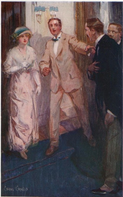
THE SPY UNMASKED