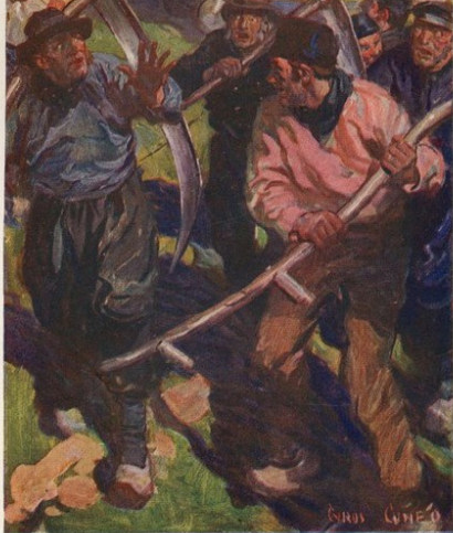
"THE PEASANTS SCATTERED OUT OF ITS PATH"